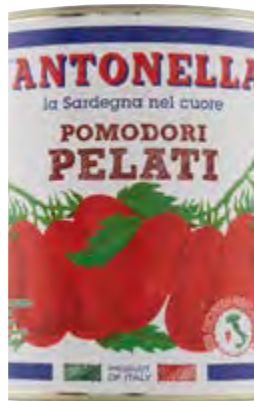
ANT700201 Peeled Tomatoes