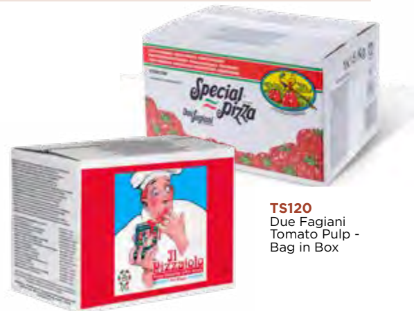
TS120 Due Fagiani Tomato Pulp - Bag in Box