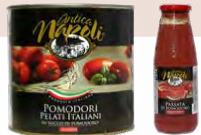
TN001 Plum Peeled Tomatoes