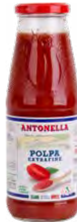
ANT930401 Fine Pulp Passata