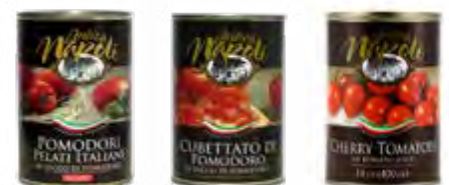
TN050 Peeled Tomato