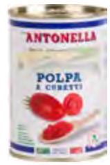
ANT830601 Chopped Tomatoes