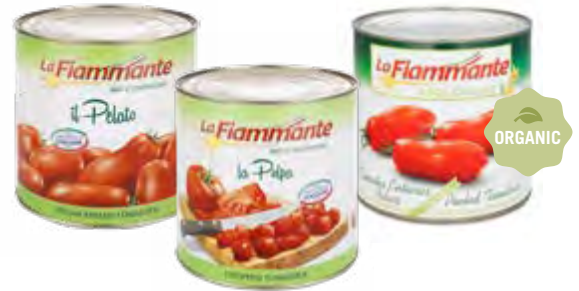
TM001 Plum Peeled Tomatoes