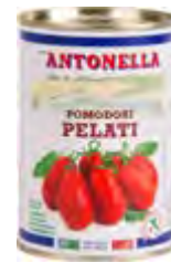
NT6306 Peeled Tomatoes