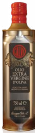
CAL404 Tin Bottle