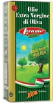
BL015 100% Italian Extra Virgin Olive Oil - Tin

Levante's golden-green oils are still the result of the family's passion and respect for the land and the traditional harvesting methods.