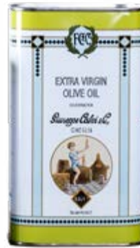
CAL00044 Vintage Tin