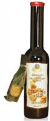
CAL003 Truffle Oil