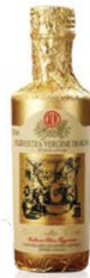
CAL5586 Mosto Oro