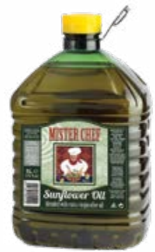
BLO20B Sunflower & Extra Virgin Oil Blend - Pet