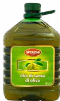
PA002 Pomace Olive Oil - Pet

Oleificio Speroni is located near Parma, an area world renowned for its specialty foods.