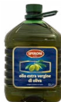
PA006 Extra Virgin Olive Oil - Pet