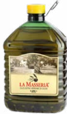
BLO01 La Masseria Extra Virgin Olive Oil - Pet