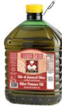
BLO20A Sunflower & Pomace Oil Blend - Pet